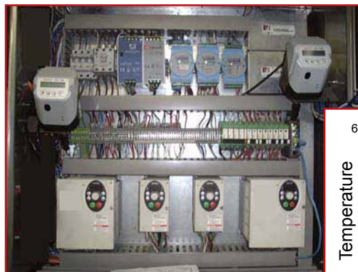
HARDWARE TO CONTROL GATES AND PRODUCT SUPPLY